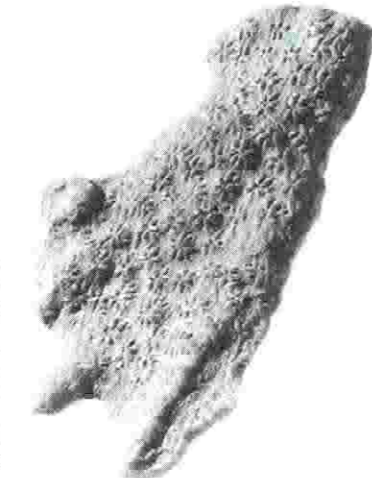
Constellaria florida , collected from the Maysville Formation, Cincinnati, Ohio

Constellaria , genus of extinct bryozoans (small colonial animals that produce a skeletal framework of calcium carbonate) especially characteristic of Ordovician marine rocks (505