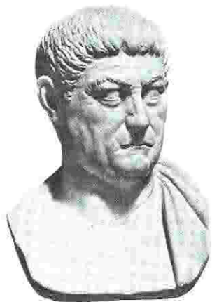
Constantius I Chlorus, marble bust; in the Capitoline Museum, Rome

stepdaughter of the emperor Maximian. Four years later Constantius was adopted by Maximian and made his caesar. The two men, together with Diocletian and his caesar, Galerius, formed the tetrarchy.